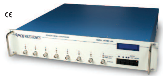
Series 498A 8-channel configuration