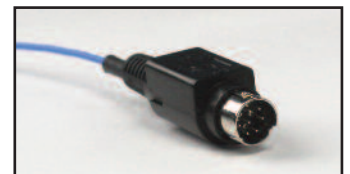
Bridge input mating connector