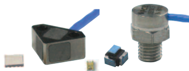
Series 3501 & 3503 MEMS High-G Shock Accelerometers