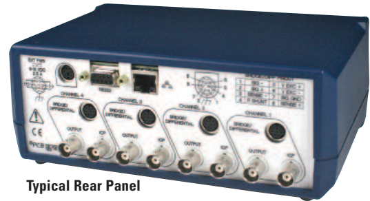
Typical Rear Panel

The Model 482C27 four-channel, benchtop signal conditioner is full-featured and cost effective. It offers low noise operation and simplicity of use. Each channel is selectable between two input types: Bridge/MEMS or ICP®/Voltage.