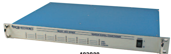
483C28 8-channel version, computer control only

As with all PCB® instrumentation, this model is complemented with toll-free application assistance, 24-hour customer service and is backed by a no-risk policy that guarantees satisfaction or your money refunded.